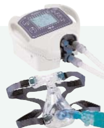
VSIII and Full Face Ultra Mirage NV

ResMed is committed to developing innovative, effective and easy to use solutions, to assist medical professionals in helping to improve the quality of life of patients.