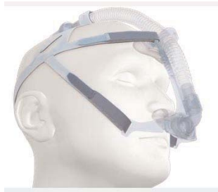
NP15 nasal pillow mask

NP15 nasal pillow mask from Weinmann has two ball-and-socket joints that enable more freedom of movement without affecting the fit. Exhaled air is directed away from the face. Made of silicone, the pillows come in three sizes. Available outside the USA. www.weinmann.de