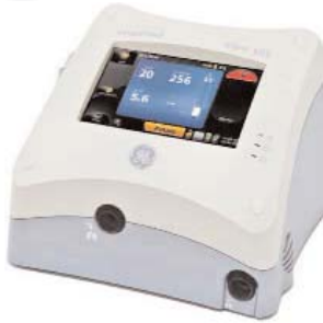
iVent™ 101 Expert